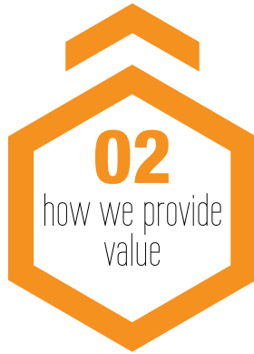
2. What value