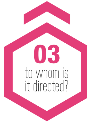
3. For whom