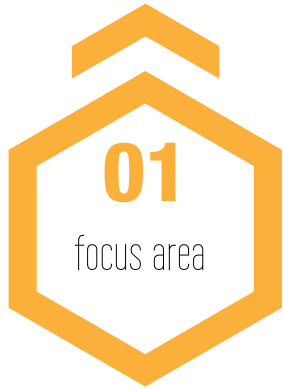
1. Focus area

steps to writing a great vision statement: